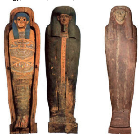
Fig. 4. On the left, the wooden anthropoid coffin belonging to Hapy (AIG 3340), featuring its interior with the mummy, wearing a funerary mask and cartonage implements (left), and its lid (right), where the partly obliterated column–inscription is visible, as well as a curled beard. On the right, the coffin of Sekhem (AIG 3343), with barely discernible hieroglyphic inscription.