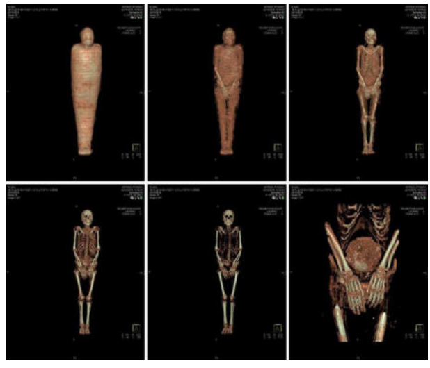
Fig. 5. The gradual virtual removal of linen wrappings for the mummy AIG 3343 is here visible, as well as the details it uncovers. The last detail-photo (lower right) reveals the placement of the separately mummified viscera packed in front of the abdomen, as was the case several times during mummification.