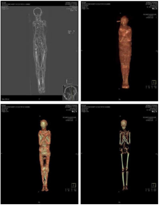
Fig. 15. The gradual virtual unwrapping of the linen bandages for the mummy AIG 3348 is here shown, as well as the details it uncovers. The first b/w photo (upper left) reveals the whole-body configuration of the mummy (from the back side), proving the disordered placement of bones in the thoracic cavity, as well as in the upper abdomen; cf. also the last photo (lower right), featuring the X-crossed hands of this particular mummy (opposite to the posture of all the other scanned ones), symbolizing her identification to Osiris (let us not forget that she was a priestess). The poorer wrapping of the corpse (compared e.g.: to that of 3343) is clearly visible (see Fig.15 (UR & LL) and Fig. 5 (UL & UC)).