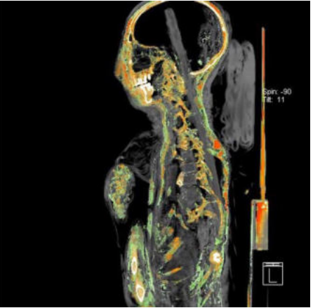
Fig. 12–13. On the left, lateral aspect of the upper part of the body and cranium of the mummy AIG 3348, revealing the remnants of the brain and the intact cribriform plate. On the right, same with pseudo-colours, to reveal details: the insertion of a long piece of wood to support the mummy-head is clearly visible, as well as her brain remnants shrunken at the occipital bottom part of the skull.