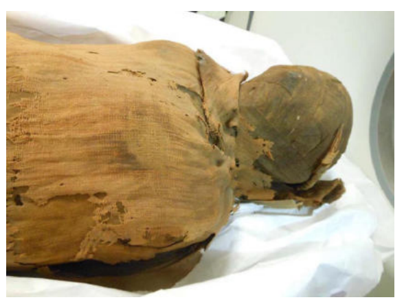
Fig. 14. Aspect from the scanning of the mummy AIG 3348, featuring abnormal protuberances of the wrappings, as well as an unusual displacement of the head, due to the supporting wood. The "prosthetic" or "cosmetic" nose is also clearly visible, protruding under the linen shroud on the covered face.