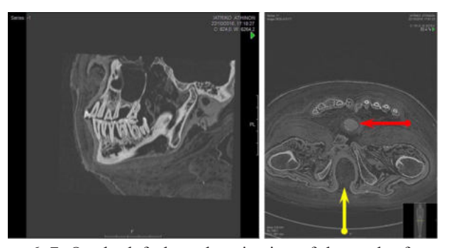
Figures 6–7. On the left, lateral projection of the teeth of mummy AIG 3343 showing extensive dental wear. On the right, the transperineal trespass for the evisceration is visible (yellow arrow), as well as the remnants of the penis (red arrow); on the same picture the embalmment technique and the bandages used tightly are also visible, revealing a good and professional mummification work (the best of all other scanned corpses).